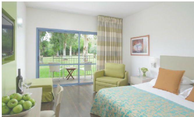
The Nof Ginnosar Hotel is set in a quiet park-like setting on the Sea of Galilee.

Tabgha , where Jesus fed 5,000 men and their families.