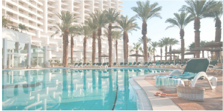
DAVID RESORT AND SPA is your oasis in the Negev Desert.

Stand at the threshold of a synagogue where Jesus taught at Magdala village , home of Mary Magdalene. Take in the view from Mount Arbel , where Jesus gave the Great Commission. If you are up for the climb, hike the nature trail to the top. If not, ride the bus and welcome the climbers. Stop to view the extensive ruins of Chorazin , the city Jesus cursed. Continue on to Tel Hazor a fortress conquered by Joshua