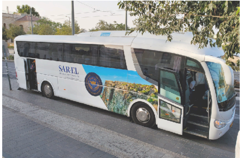
Our trusted partner Sar-El Tours shares the Philip's House passion for life-changing encounters in Israel, unlike any other.

Experience a boat from the days of Jesus at the Ginasaur Boat Museum .