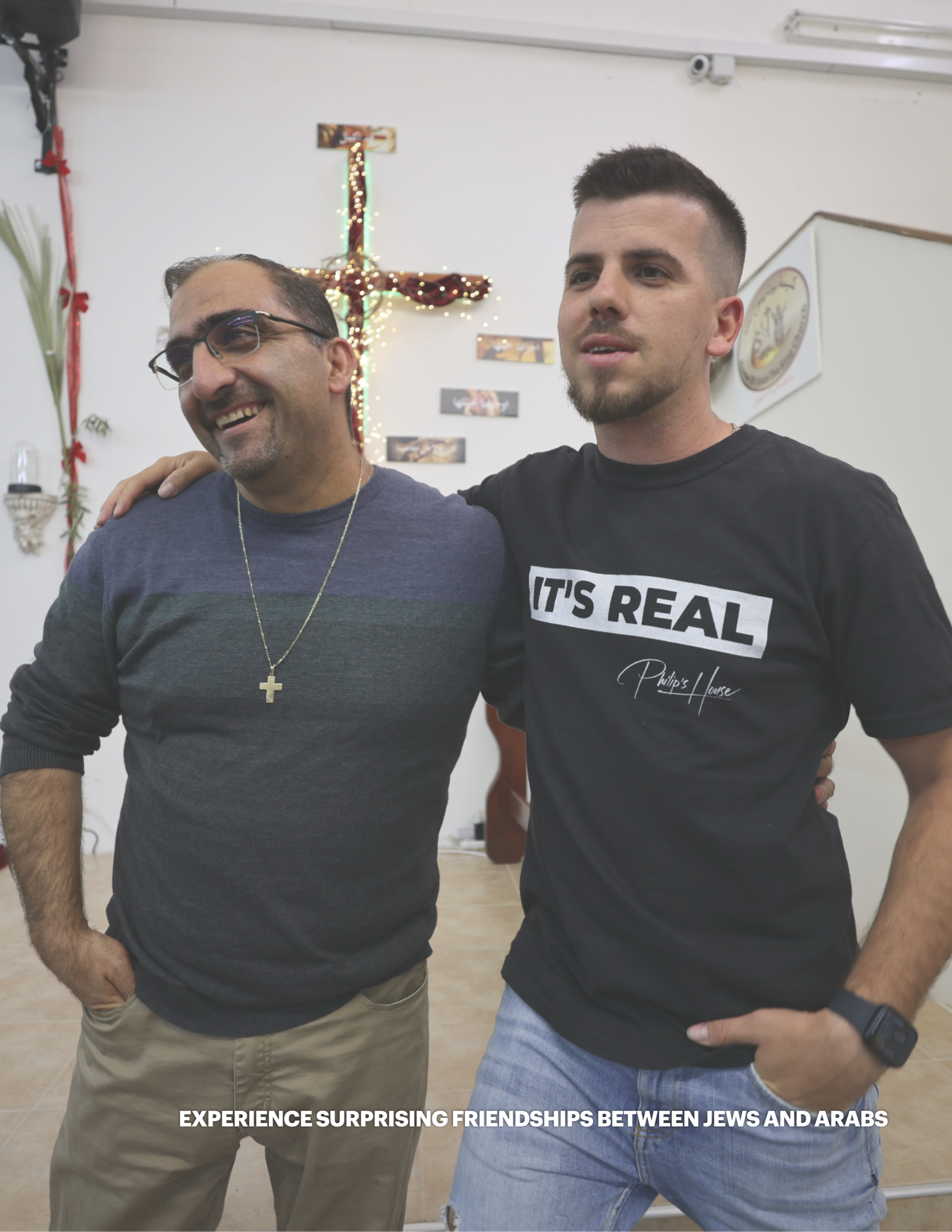
EXPERIENCE SURPRISING FRIENDSHIPS BETWEEN JEWS AND ARABS