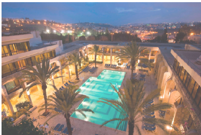
Dan Panorama Hotel is a newly renovated, historic hotel, just a half mile from Zion Gate in Jerusalem.

The Pool of Siloam , where the blind man washed his eyes to see.